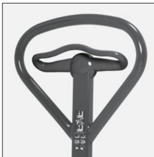
Ergonomic operating handle