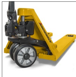
Permanently lubricated joints for maintenance-free operation