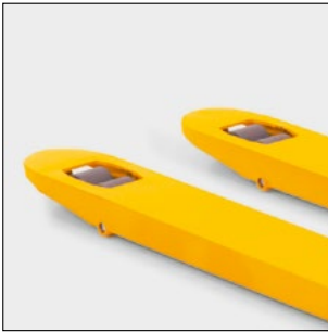
Contoured fork tips for easy pallet entry