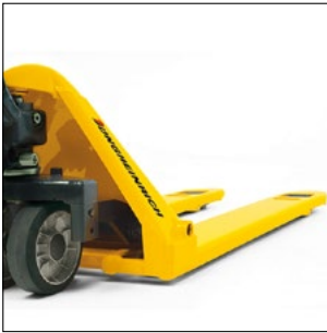
Low profile, sturdy forks