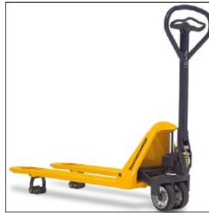
Permanently lubricated joints for maintenance-free operation