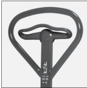
Ergonomic operating handle